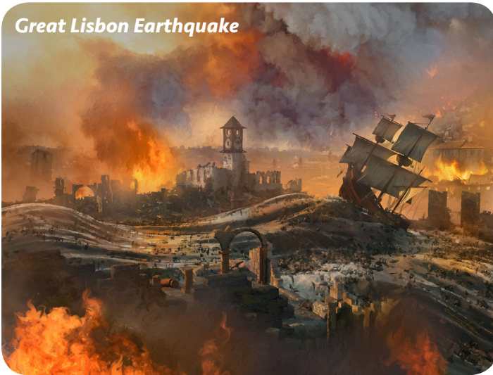
Great Lisbon Earthquake